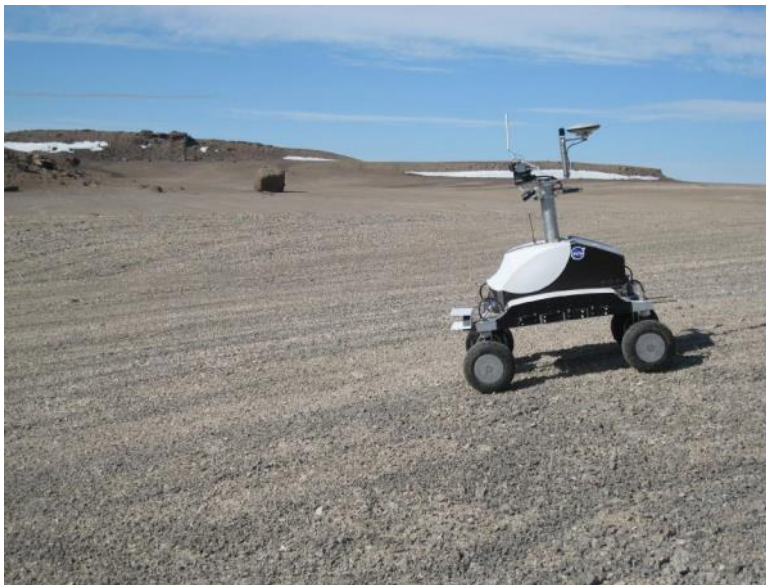
K10 Black conducting ground-penetrating radar survey at Houghton Crater, Devon Island, Canada

Devon Island is the largest uninhabited island on Earth. Located in the Canadian Arctic, it's frozen over most of the year and nearly devoid of life. However, every summer, for a period of about two months, it becomes a training and proving ground for Mars missions. Devon is used to test vehicles, space suits, tools and all types of equipment.