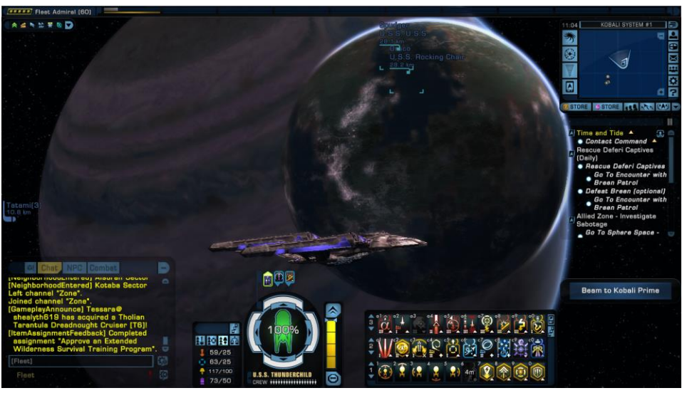
Here the USS Thunderchild enters orbit around the Kobali Prime.

In the upper right corner of the screen is a mini map HUD (Heads Up Display); this shows the local