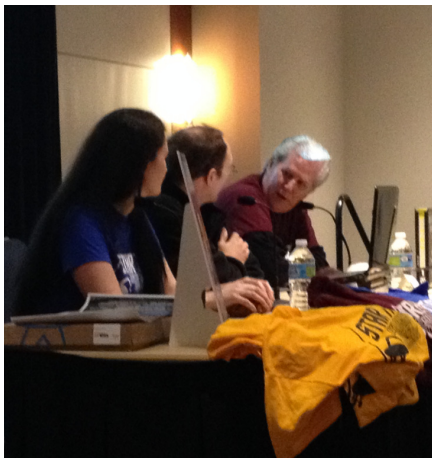
The Star Trek New Voyages panelists.