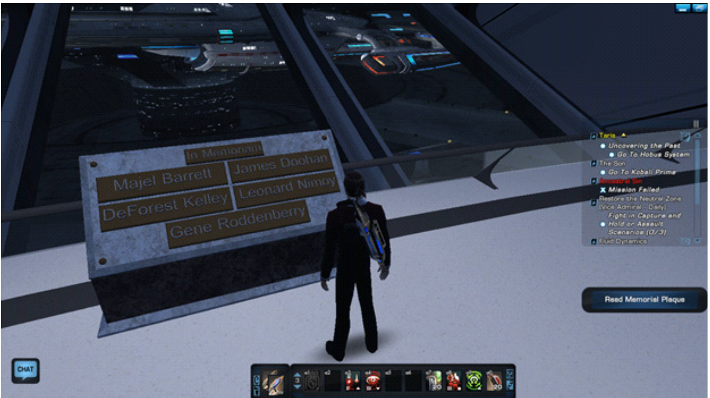
Memorial on Earth Station to many involved in Star Trek's history and development.

Also in conjunction with his death, the developers have also added a memorial on Earth Station to those actors from TOS who have already left us; a very touching tribute.