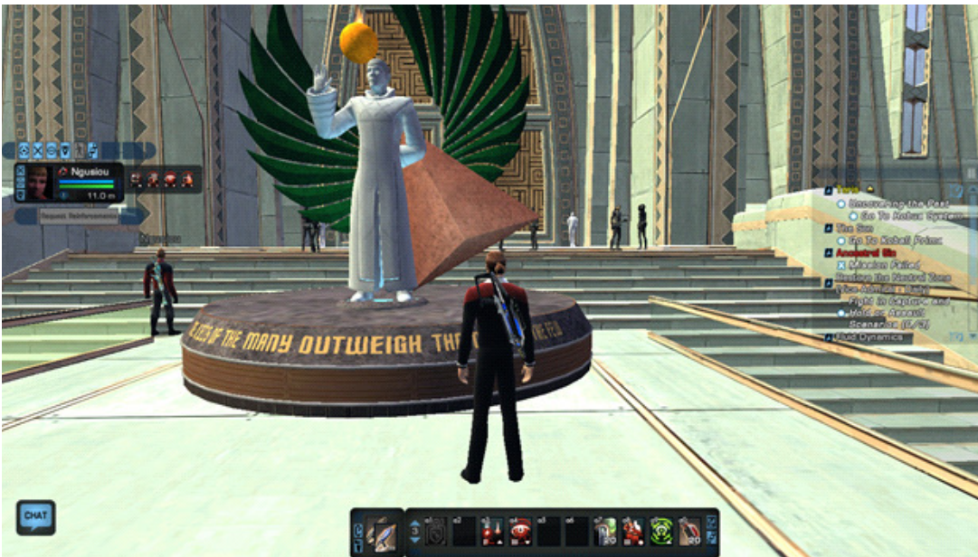
Ambassador Spock memorial on New Romulus

Upon entering the Delta Quadrant, a myriad of options are available for Captains to participate in, with many continuing story lines that originated in the Voyager series with familiar locations and characters.