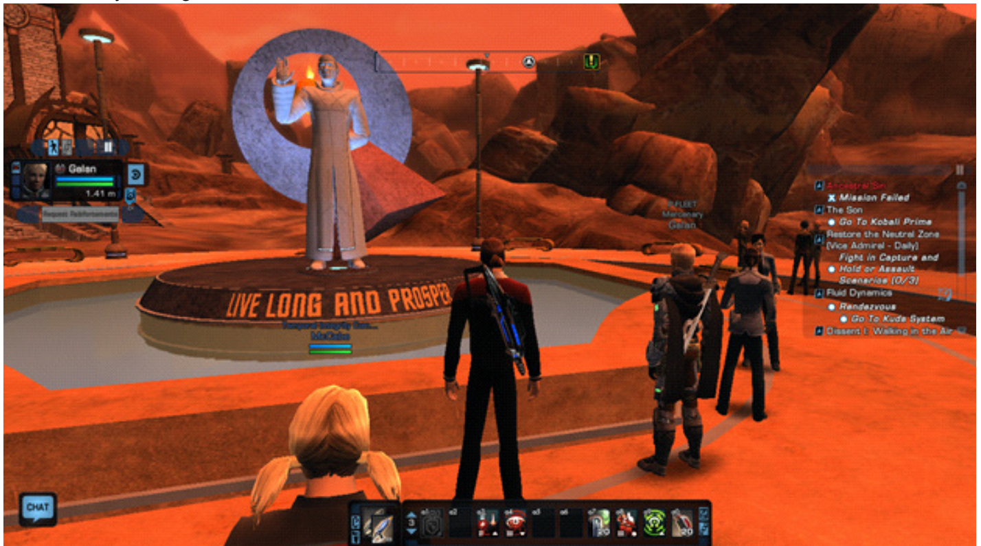
Ambassador Spock memorial on Vulcan

(allowing players from each faction to participate) to journey to the Delta Quadrant to investigate the current situation.