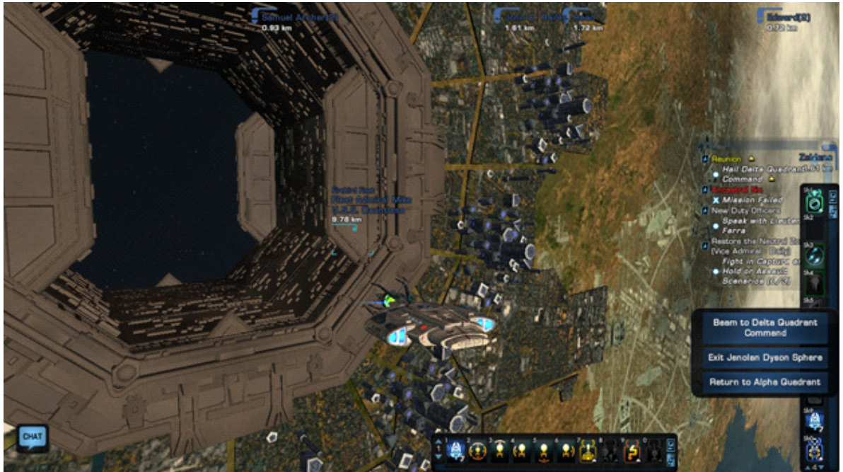
USS Thunderchild preparing to exit the Jenolan Dyson Sphere into the Delta Quadrant.

The new season of STO went live in October with "Delta Rising". This new expansion introduces many elements from the Voyager series, around 30 years later; locations, species and characters among them. Joining the cast for Delta Rising are now - Admiral Tuvok, the EMH "Doctor", Seven-of-Nine, Neelix, and Harry Kim.